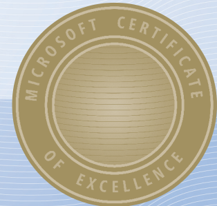
Steven A. Ballmer Chief Executive Officer

A handwritten signature in black ink, which appears to read "Steven A. Ballmer".