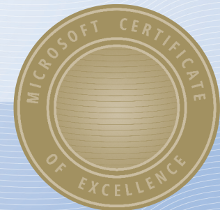
Steven A. Ballmer Chief Executive Officer

A handwritten signature in black ink, which appears to read "Steven A. Ballmer".